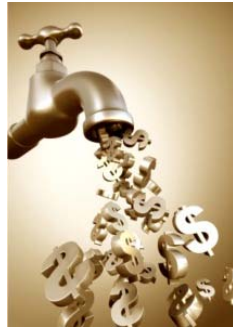
The SBA 504 Program is opening up the spigot a little more.

The SBA 504 Program Loan now can be used to refinance a conventional bank loan and even provide some money to pay business expenses, said Lance Fos-