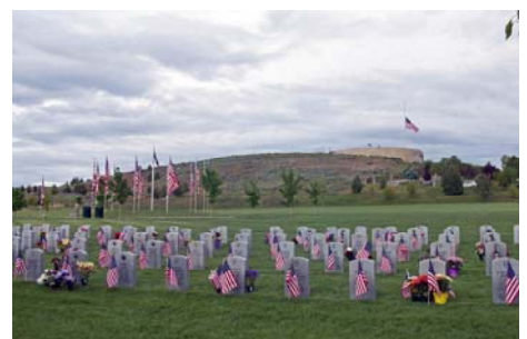
Answer to May Issue: Idaho State Veterans Cemetery , in Boise.

Clue for this month's " Where in Idaho is this? " During WWII, this was the site of a Naval Training Base, the largest town in Idaho. Today, it's the site of a Naval Acoustic Research Detachment (yep, the lake is deep enough for submarines).