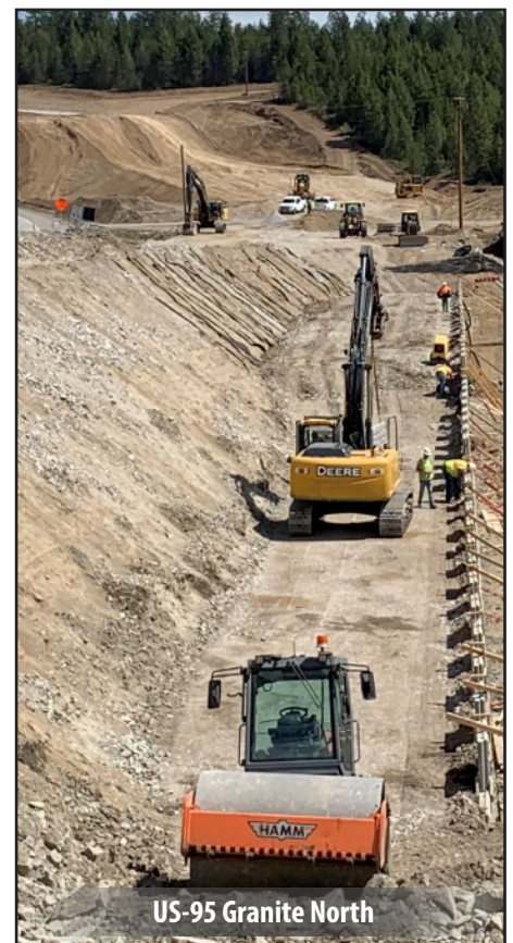
US-95 Granite North