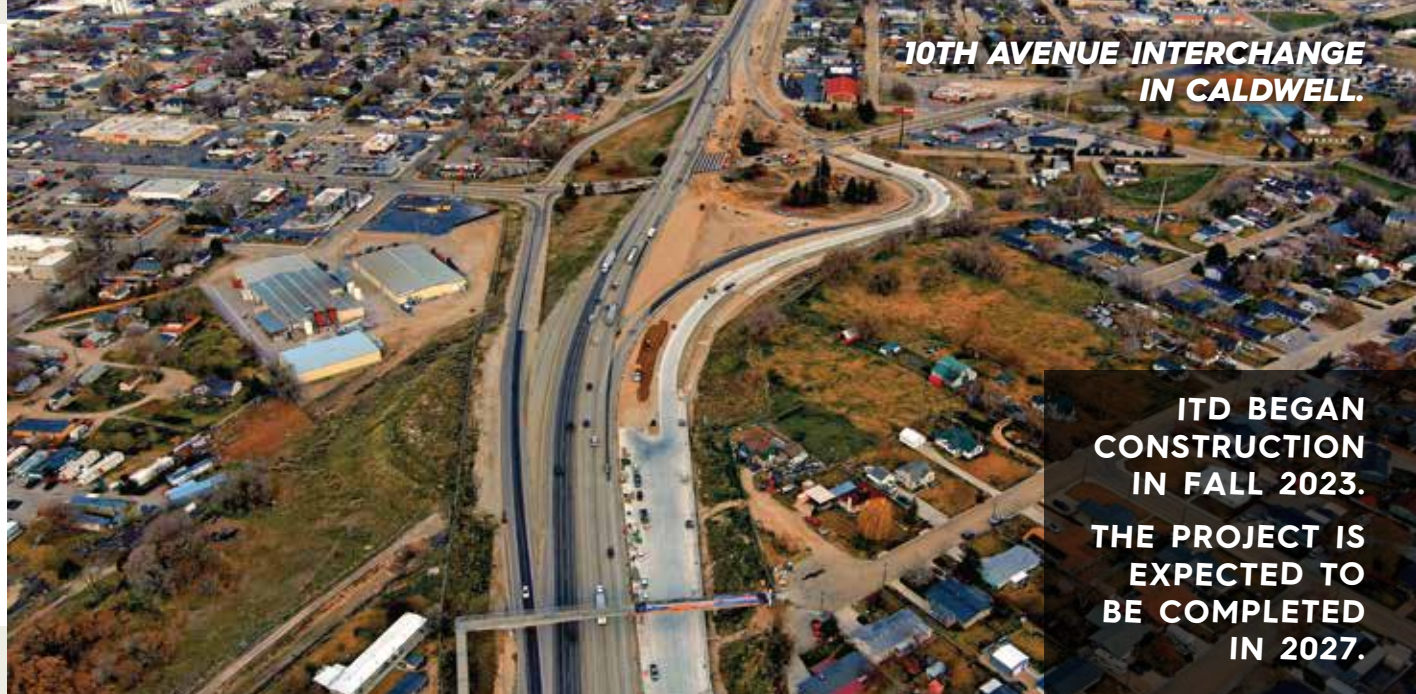
10TH AVENUE INTERCHANGE IN CALDWELL.

ITD BEGAN CONSTRUCTION IN FALL 2023. THE PROJECT IS EXPECTED TO BE COMPLETED IN 2027.