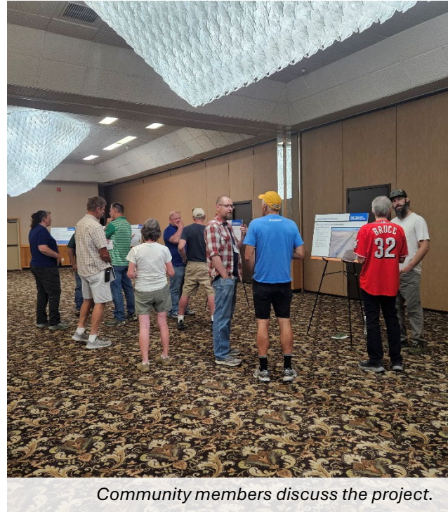
Community members discuss the project.

ITD and members of the project team were on hand to discuss the project and answer questions. Community members were encouraged to fill out comment sheets after reviewing the information.