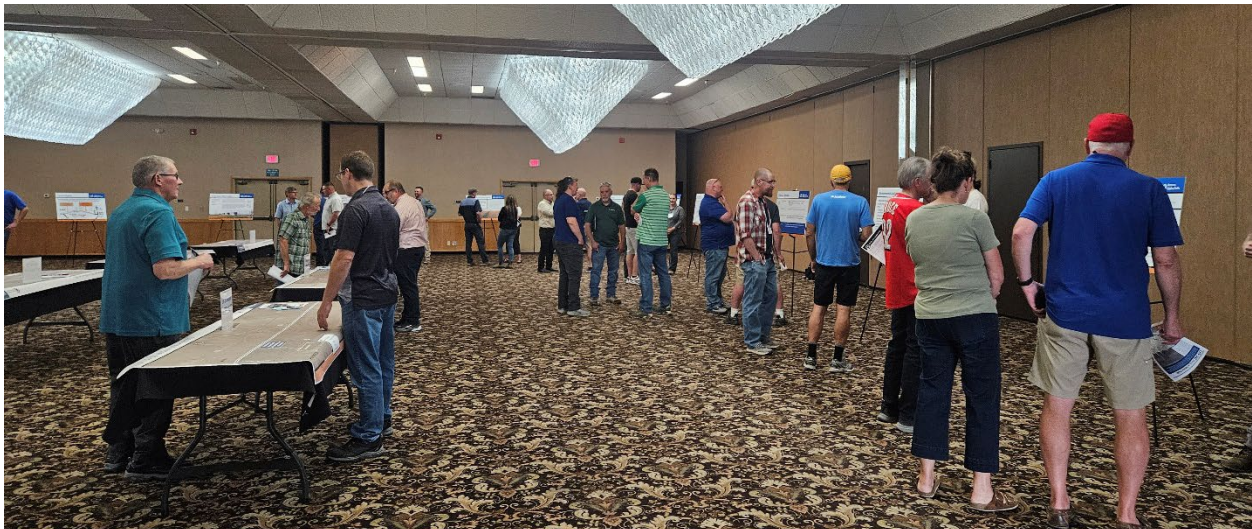
Members of the community review display boards and speak with project staff.