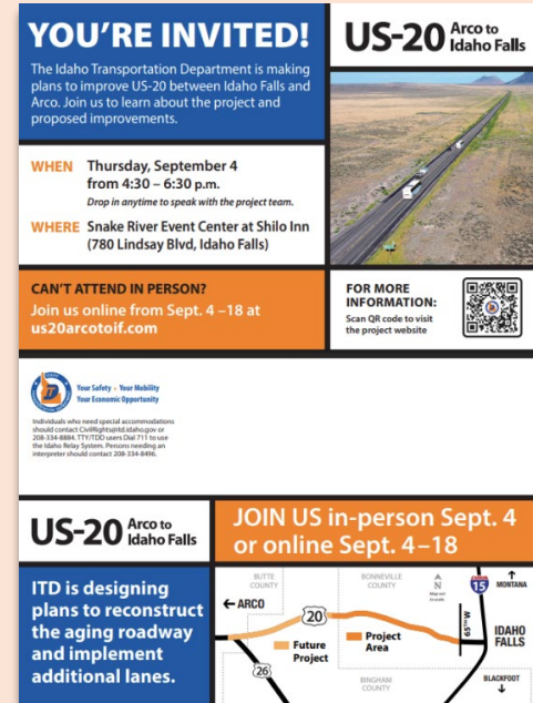
Front and back of invitation postcard.

A Facebook post was made on Aug. 28 to notify the community about the in-person open house and online meeting. Altogether, the post received 87 likes, comments, shares or reactions.